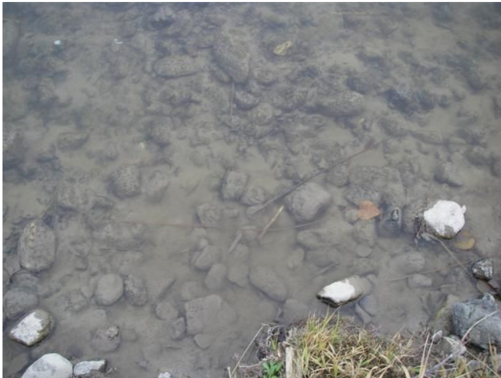
Photo 1 Sediment accumulation on and around river substrate material located approximately 100 m downstream of the erosion zone (November 09, 2010)

Details of the proposed compensation plan are presented below.