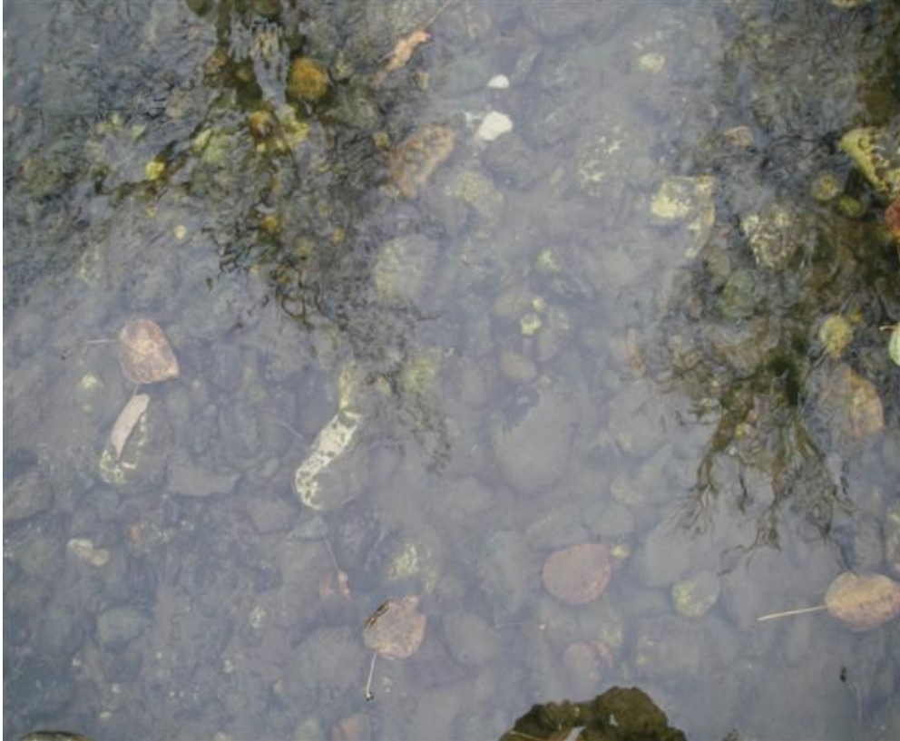
Photo 2 Clean substrate found upstream of the erosion zone (November 09, 2010)