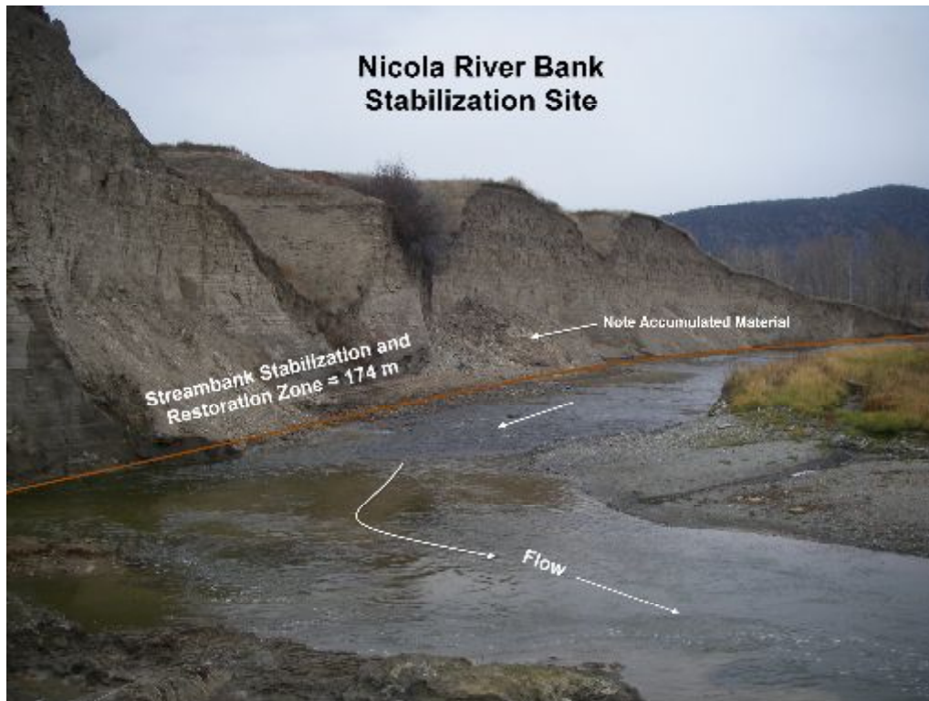
Photo 3 Proposed bank stabilization site on the Nicola River. Facing upstream.