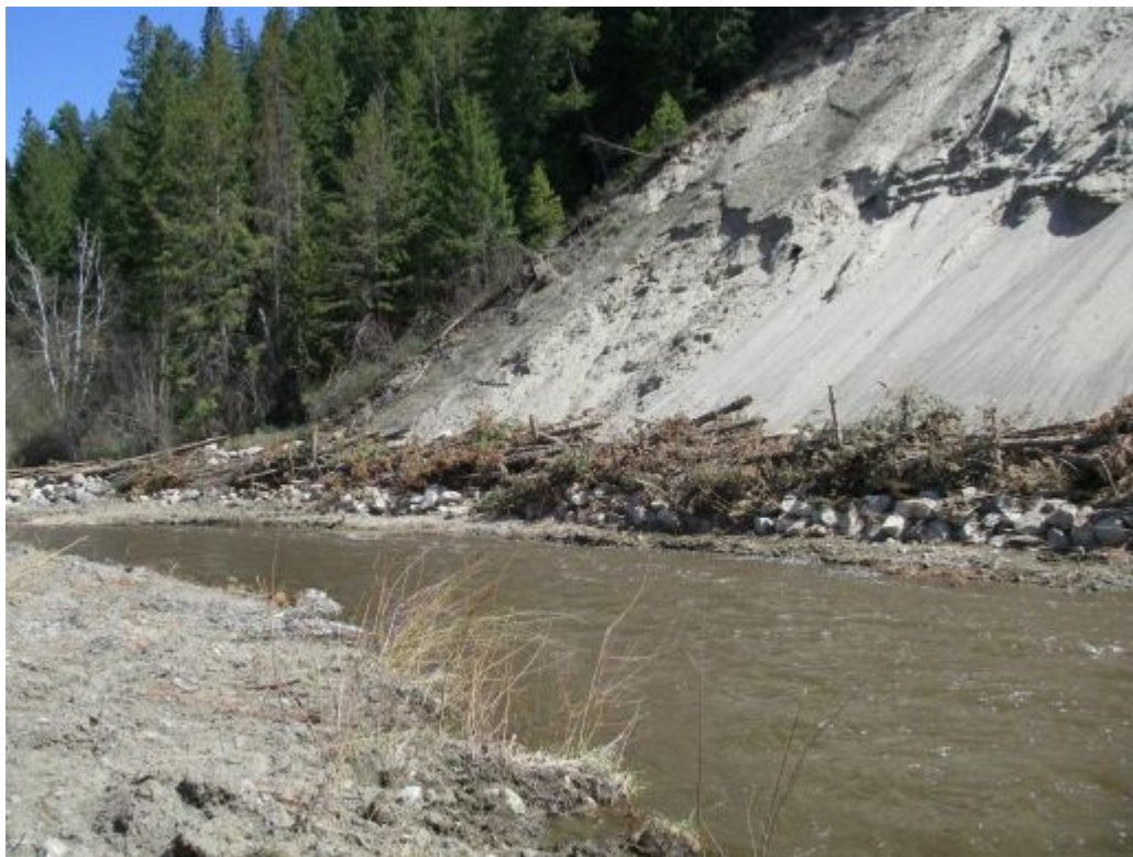
Photo 4 Bank stabilization and channel enhancement site constructed on the Salmon River in 2009 using a similar approach proposed for the Nicola River site. Facing downstream.